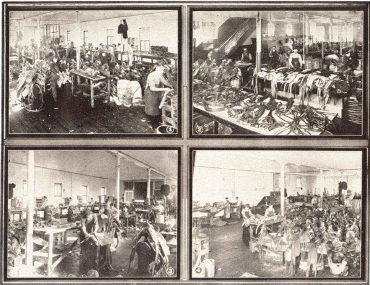
TO SHOW YOU WHERE THE FRAZIER FAMOUS PUEBLO SADDLES AND HARNESS ARE MANUFACTURED.