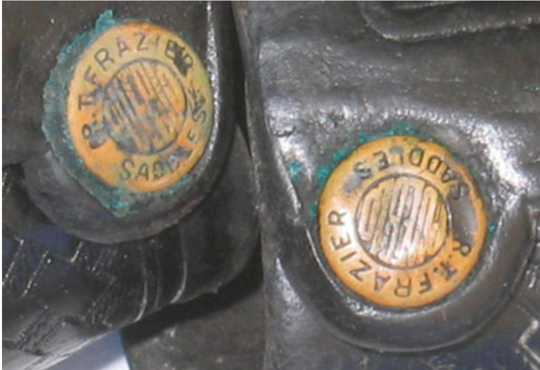
R.T. Frazier Pueblo Saddles Brass Snap Cover