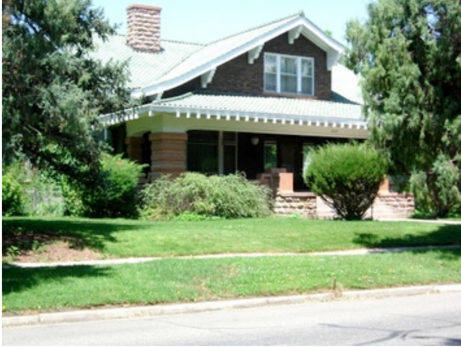
R.T. Frazier House: 2121 Elizabeth St., Pueblo, CO