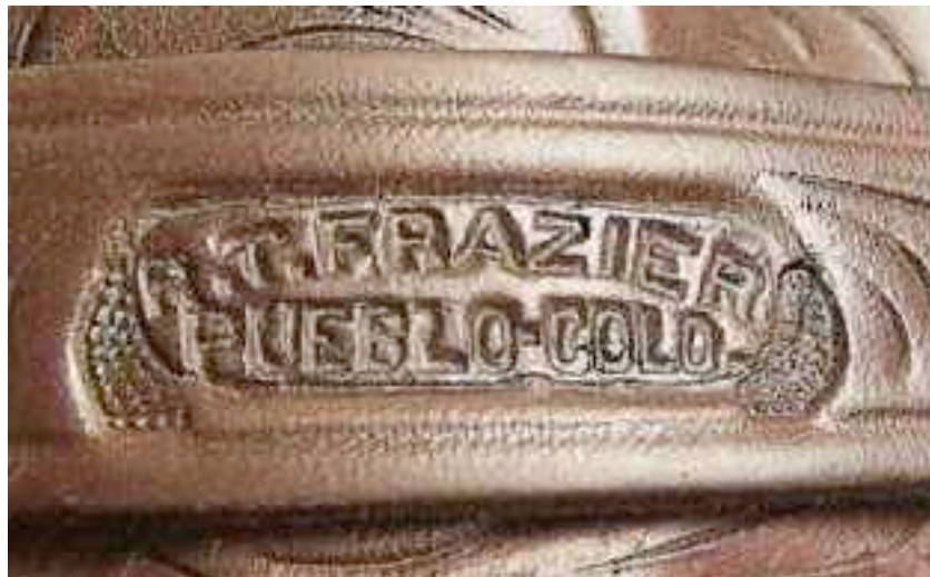
R.T. Frazier Pueblo Rectangle Holster Loop Mark