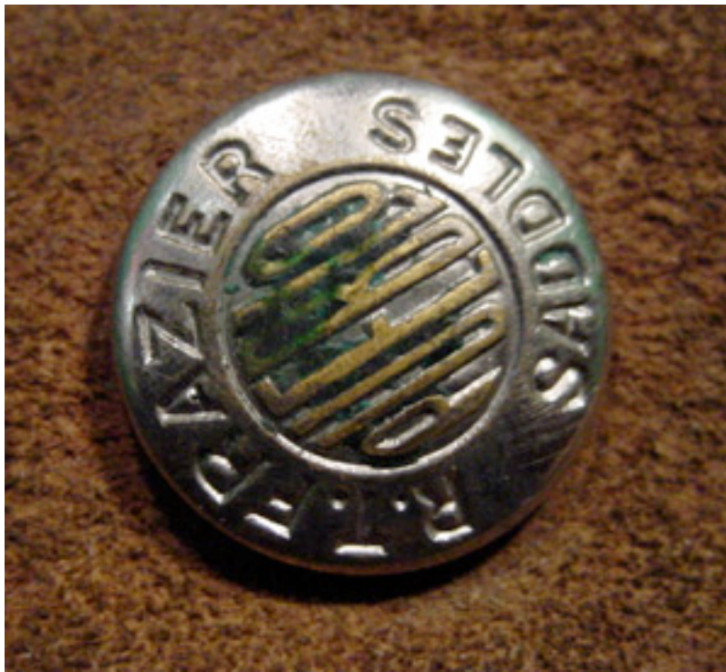
R.T. Frazier Pueblo Saddles Nickel Snap Cover